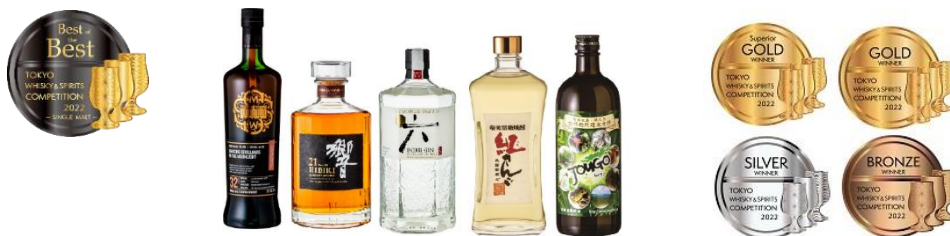
Best of the Best winners from 2022

At TWSC, comments collected from judges are fed back to entrants. This is a free service provided for all entries, regardless of the awards. Rather than just results, judges’ scoring logic and suggestions for improvement are given to entrants, enabling future product/service quality improvement. Many entrants have found new aspects of their products as well as renewed confidence in their brands.