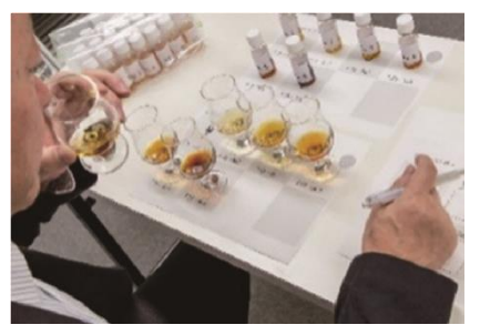
【Re-bottling into mini bottles】